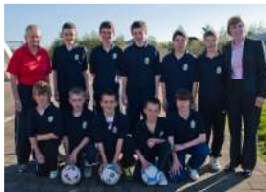
Futsal Soccer Winners 2010