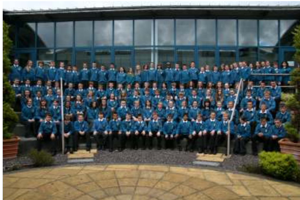
The First Year Students of 2010 - 2011