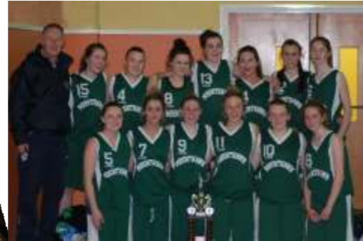
Regional Cadet Basketball Winners December, 2010