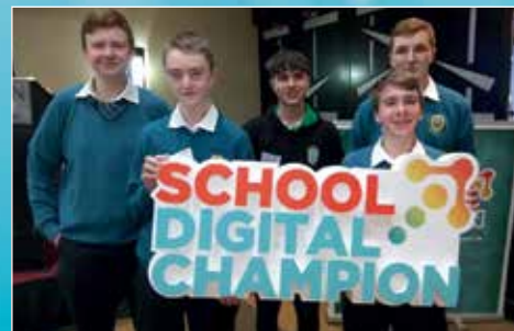
School Digital Champions

Mercy Mounthawk Secondary School Mounthawk Tralee, County Kerry