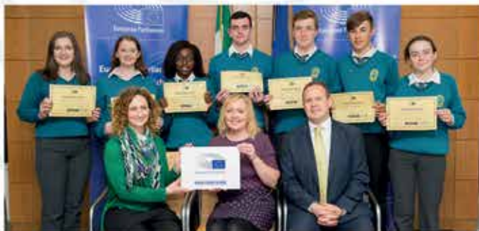
Mercy Mounthawk Tralee with Lynn Boylan MEP