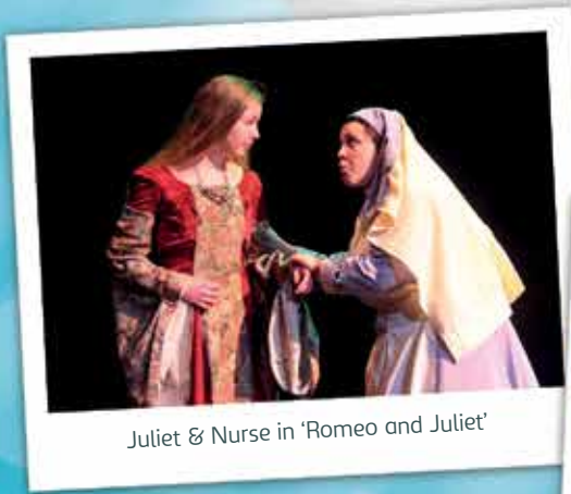
Juliet & Nurse in 'Romeo and Juliet'