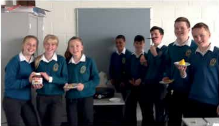
Crepes for Class 1.4