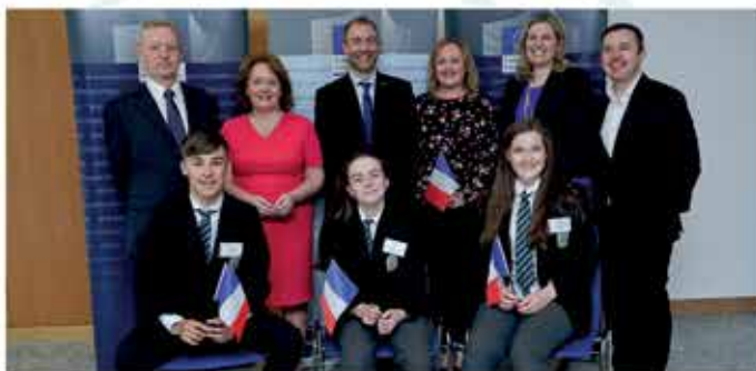
Model European Parliament