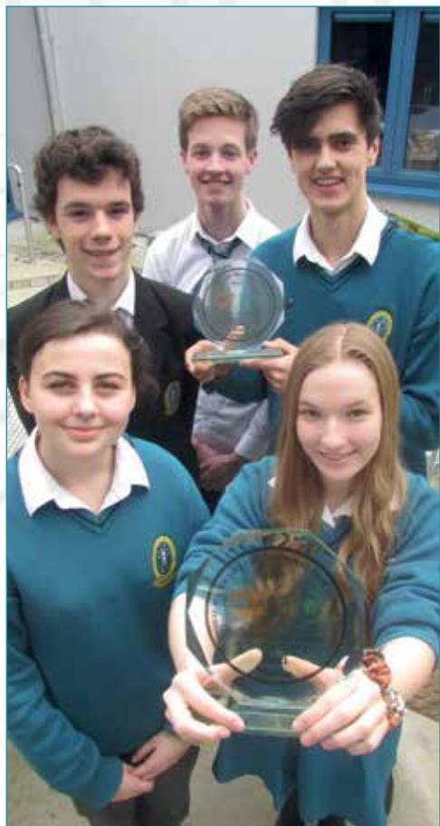
Winners of the Donal Walsh Live Life Film Awards