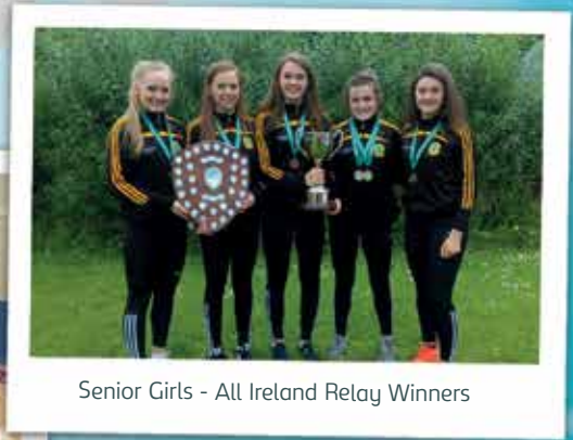
Senior Girls - All Ireland Relay Winners