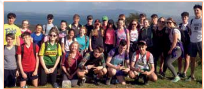
TY Gaisce Walk