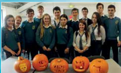
5th Years with pumpkins for Halloween