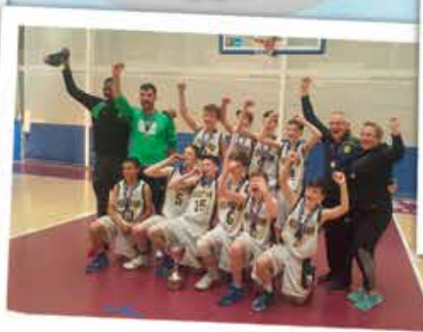
Basketball - 1st Year All-Ireland A Winners