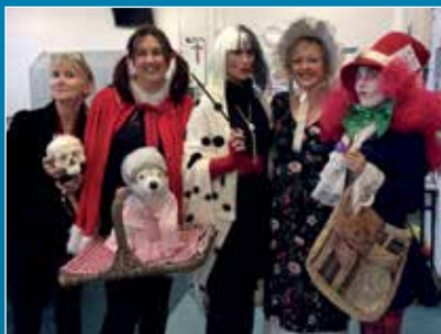
Teachers dress up for World Book Day

To end a wonderful Literacy Week, the school had a 'Book Character Dress-Up Day'. T.Y. students and some teachers dressed up as their favourite book characters. There were two competitions for T.Y.'s, a Best-Dressed Competition for the students with the best costumes, and a competition to guess the characters personified by the teachers. It was a fun end to the week, with costumes from Harry Potter and the Cat in the Hat all the way to Matilda. It's clear to see there's plenty of bookworms and book lovers in Mounthawk! The effort was admirable and it was great to see so many people dress as their favourite characters and bringing so much colour to the occasion.