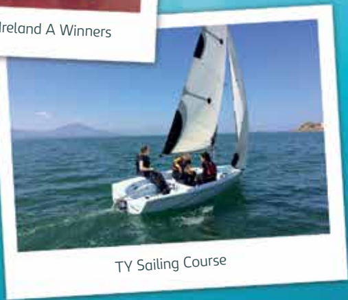
TY Sailing Course