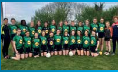
First Year Girls Football Blitz