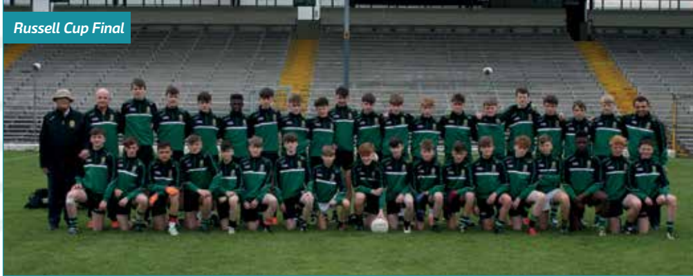
Russell Cup Final