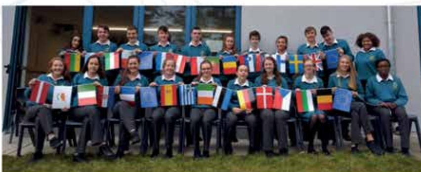
European Studies Class Photo