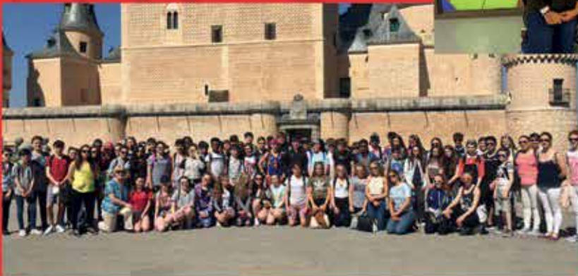
2nd Year School Tour to Madrid