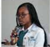
Speakers at our mock European Parliament