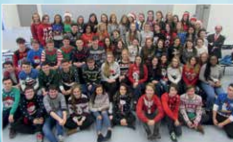
Christmas Jumper Food Appeal