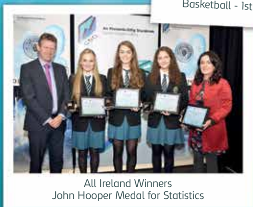
All Ireland Winners John Hooper Medal for Statistics